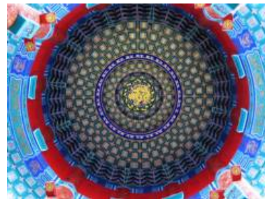
(d) Titulo debitas.