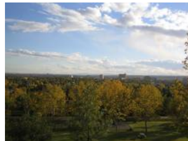
(b) Pan ma signo.