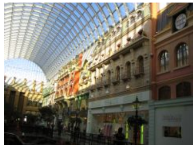
(a) Asia personas duo.